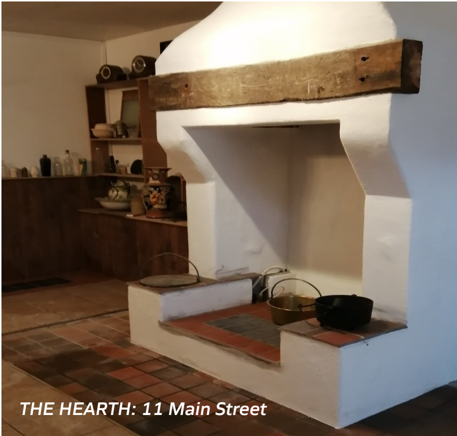
THE HEARTH: 11 Main Street